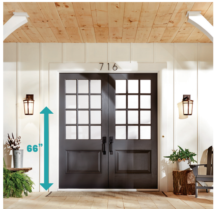
749175 | Kichler Atwood 14.25" 1 Light Wall Light—Brownstone

All exterior wall mounted fixtures should be installed with approximately 66" between the center of the fixture to the threshold of the door.