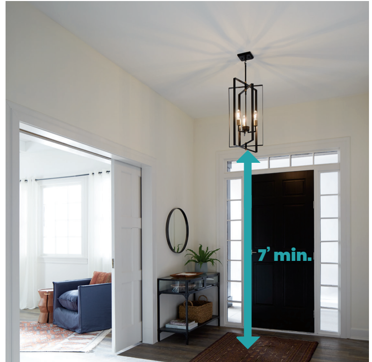
236909 | Kichler Taubert 3 Light Foyer Pendant—Black

Example: If your room is 10'x15' then the diameter of the fixture should be approximately 25". If your room is 12'x14' then the diameter of the fixture should be approximately 26".