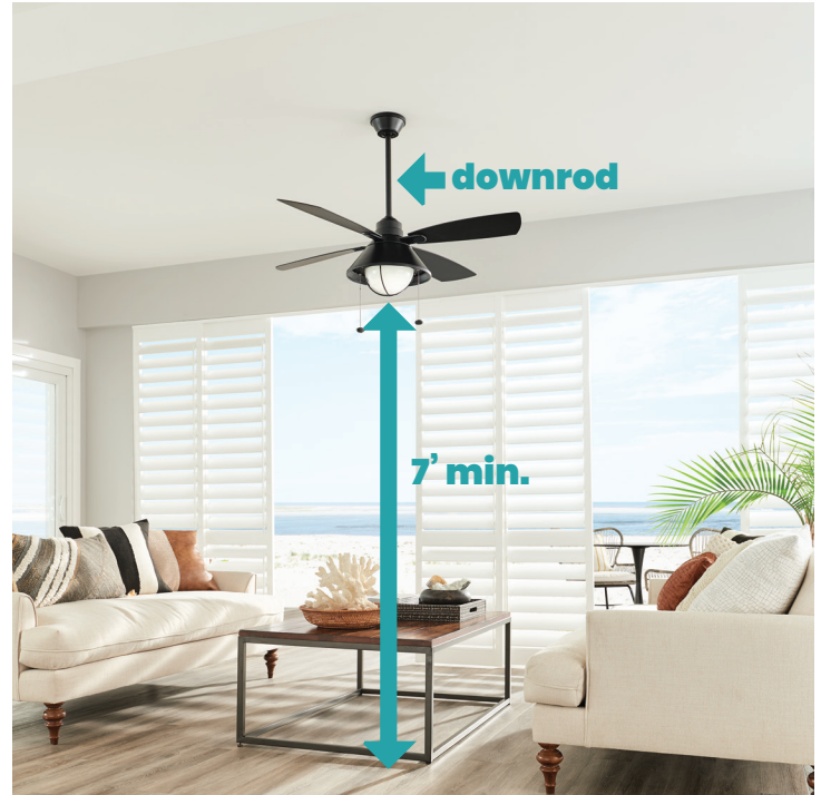
5113763 | Kichler Seaside 54" 4 Blade LED Ceiling Fan