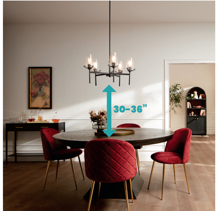
5113945 | Kichler Kitner 3 Light Linear Chandelier—Black

Example: If your dining room table is 48”W, a chandelier that is 24”–36” in diameter would be appropriate.