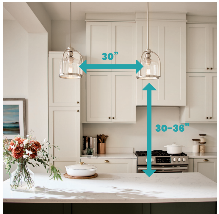
303477 | Kichler 9.5” 1 Light Mini Pendant—Brushed Nickel

If using multiple pendants, it is recommended to space the fixtures around 30” apart.